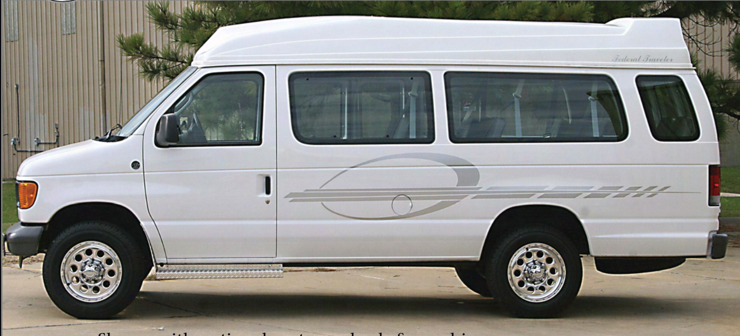
Shown with optional custom wheels & graphics.

Our 9 - 13 passenger Ford conversion includes climate control systems, cruise control, AM-FM radio, electric windows & door locks. Numerous seating, storage, and rear wheelchair lift options are available.