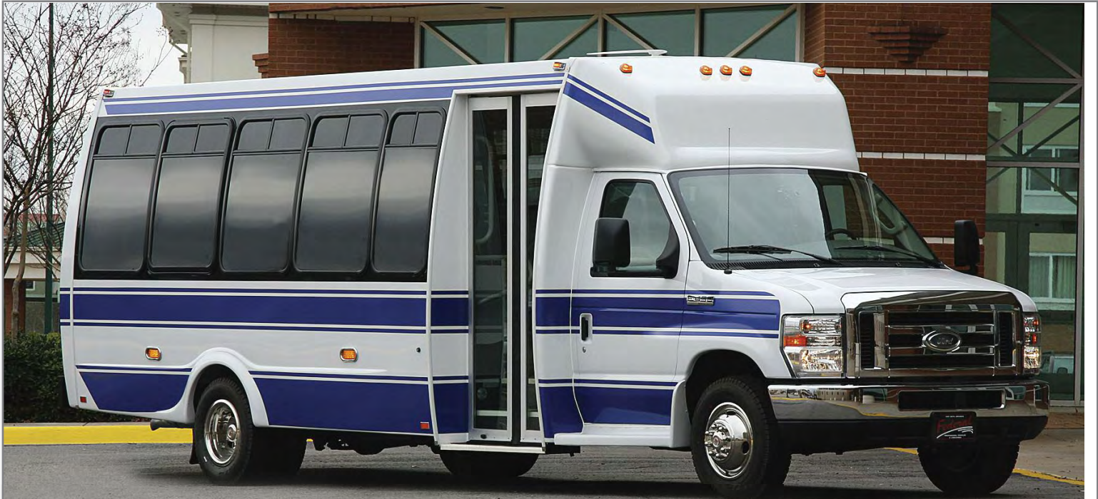
28 Passenger or 24 Passenger w/luggage shown with optional 40" electrical bi-fold door