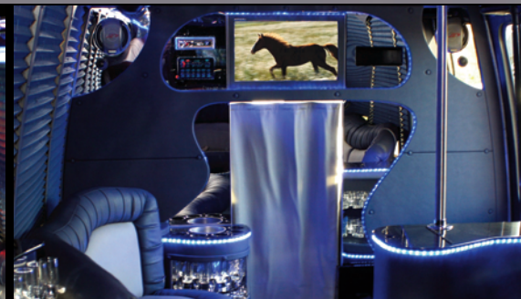
Shown with optional 37" TV