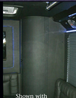
Shown with Optional Bathroom