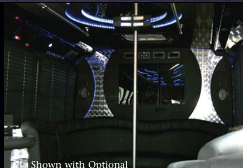
Shown with Optional Entertainment Pole