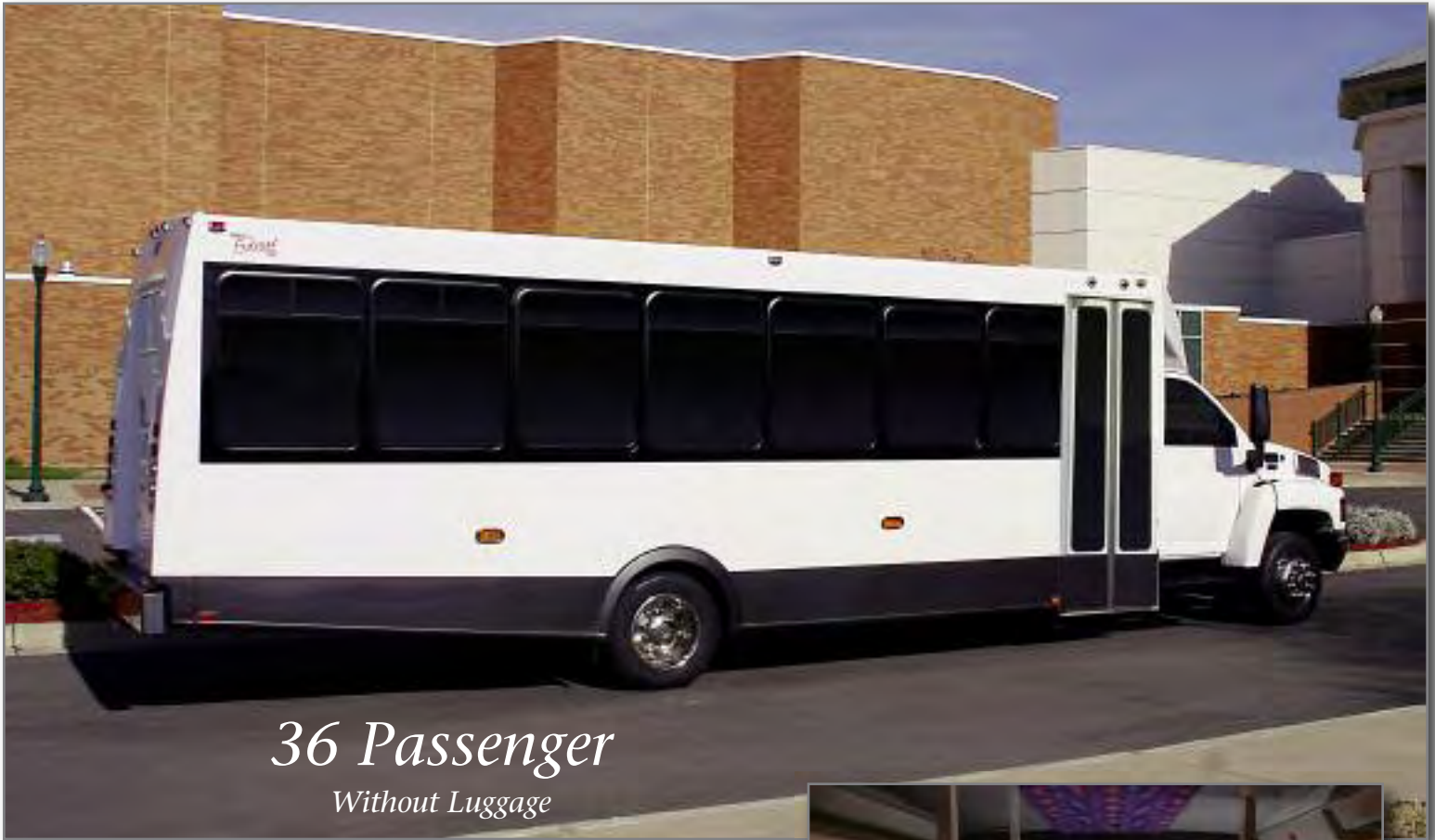
36 Passenger Without Luggage